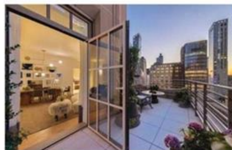
One Wall Street ► www.onewallstreet.com

One Wall Street owners can also expect their own members' club inside the building: The One Club. The club will give access to a wide array of luxury amenities, including a co-working space designed by Deborah Berke, access to the resident-only 38th floor with panoramic-view 75ft. long pool and fitness centre, 39th floor landscape garden terrace, club lounge, bar and much more.