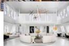
The Woolworth Tower ► www.thewoolworthtower.com

The Woolworth Tower Residences is the transformation of the top floors of NYC's iconic Woolworth Building into luxury homes. Only two units remain for sale at the building and can now be combined into one crowning residence atop the landmark. This potential combination of The Pinnacle Penthouse and the 49th floor (just below it) will occupy floors 49 to 58 with 12,131 interior sq. ft. and a 408 sq. ft. observatory terrace located 727 feet in the air. This sprawling combination is offered as a white box for residents to fully customise their own design and is priced at $59 million.