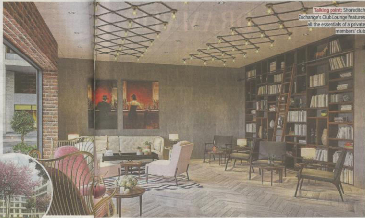
Talking point: Shoreditch Exchange's Club Lounge features all the essentials of a private members' club

THE MAKERS Nile Street, N1 This 28-storey development offers a total of 175 homes, consisting of five studios, 155 two and three-bedroom apartments and a small number of family duplexes with private roof gardens. The fantastic amenities include a screening room, two landscaped garden terraces, a gym, a treatment room, plus three - yes, three - lounges. Perfect for ad-hoc meetings and getting cosy in your favourite chair as the autumnal chill rages outside. Now, who needs a Soho House membership if you have all of this, eh? From £620,000 for a studio apartment, customerservice@themakers.com