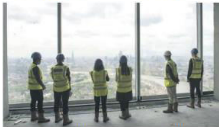
Concrete shell: There will be a garden about a third of the way up

"With new partitions and layouts we're ultimately offering a one-bed apartment for the price of a studio - hard to find anywhere else in London." Go to landmarkpinnacle.com