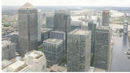
View from the top: Canary Wharf from Landmark Pinnacle

Images by Matt Grayson - find his work at graysonphotos.co.uk or @mattgrayson_photo on Insta