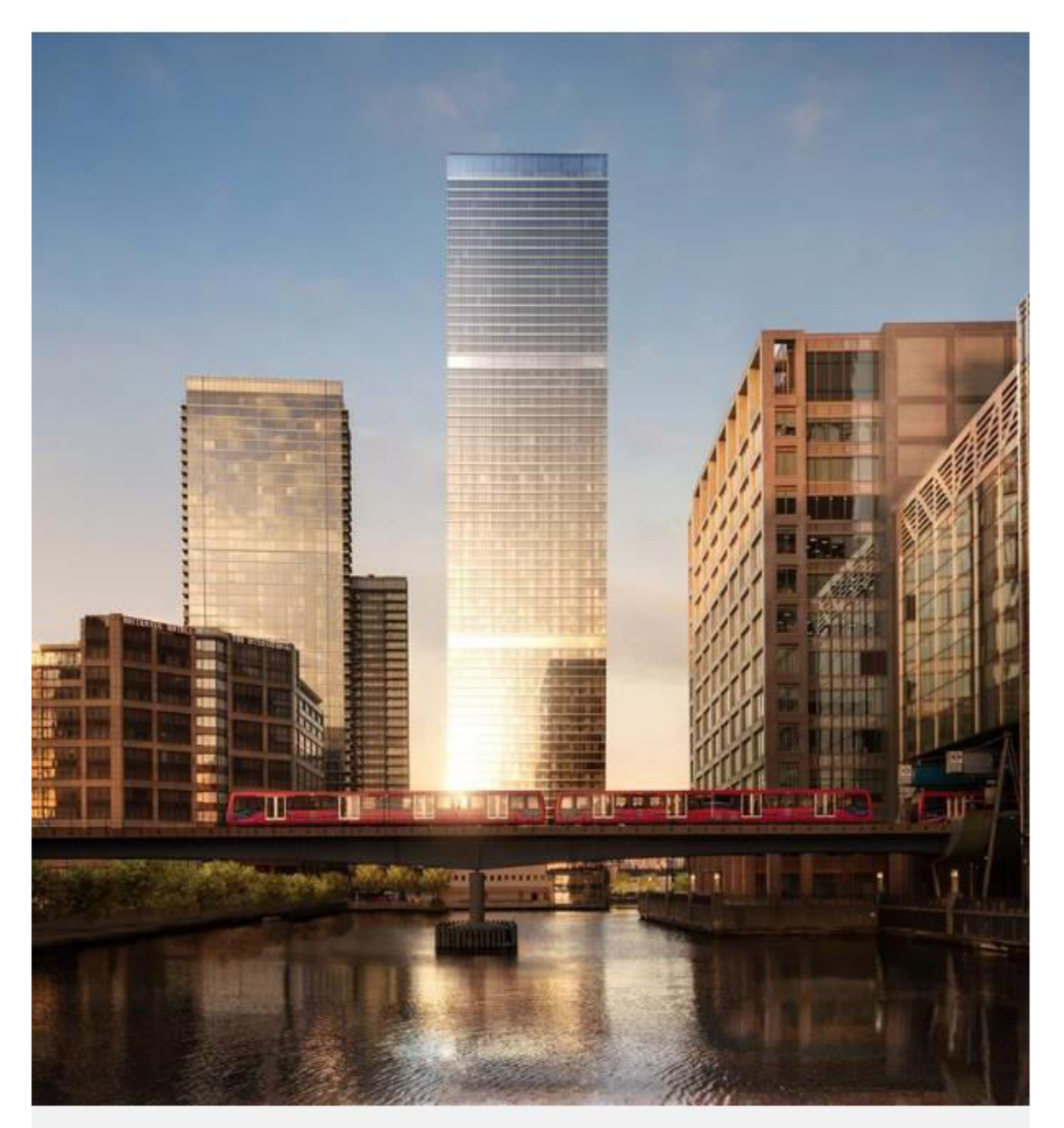
How the scheme will look when completed