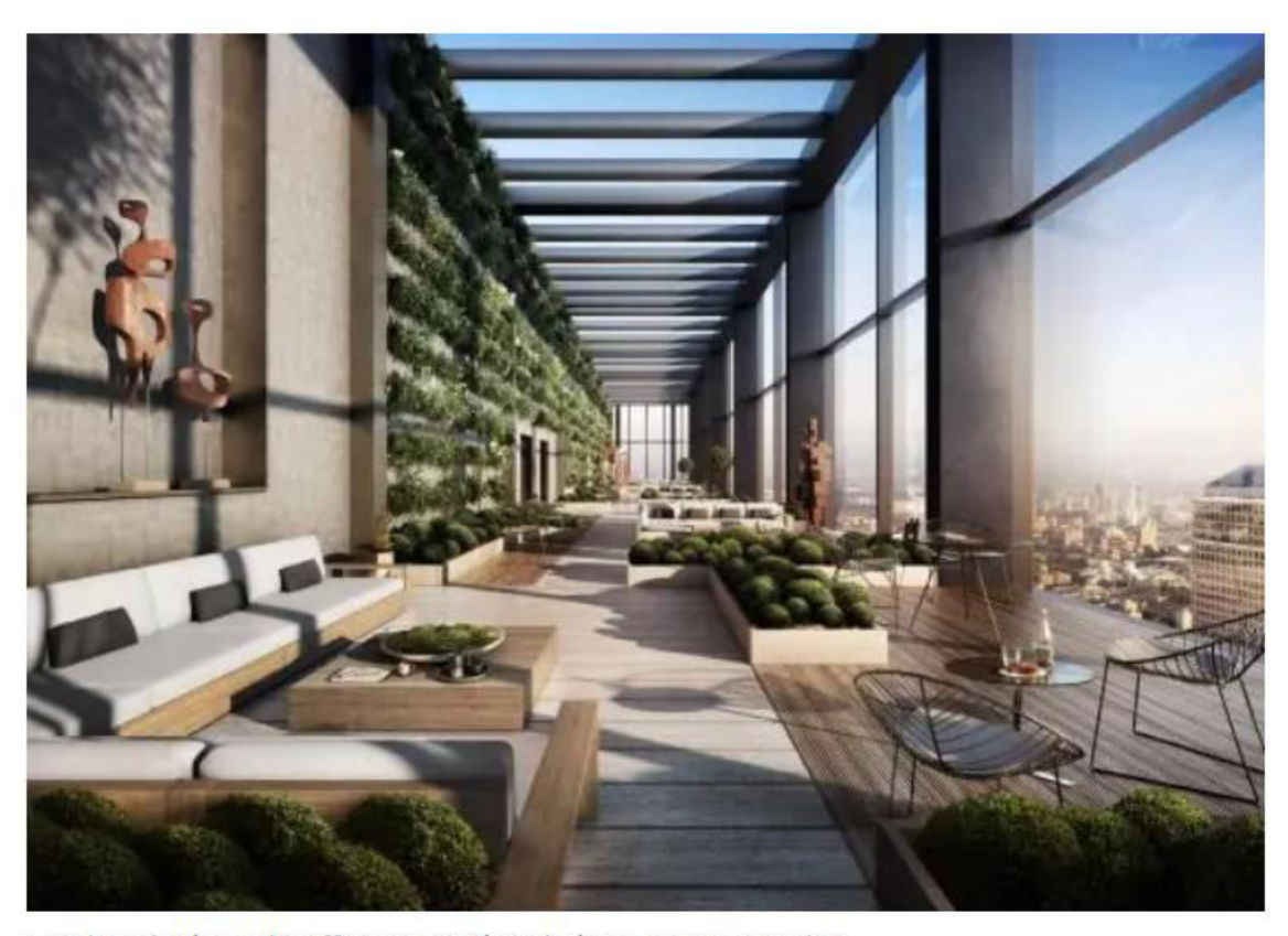
Landmark Pinnacle offers exceptional views across London

The 752 apartments are priced from £542,750. Call 020 3905 6826.