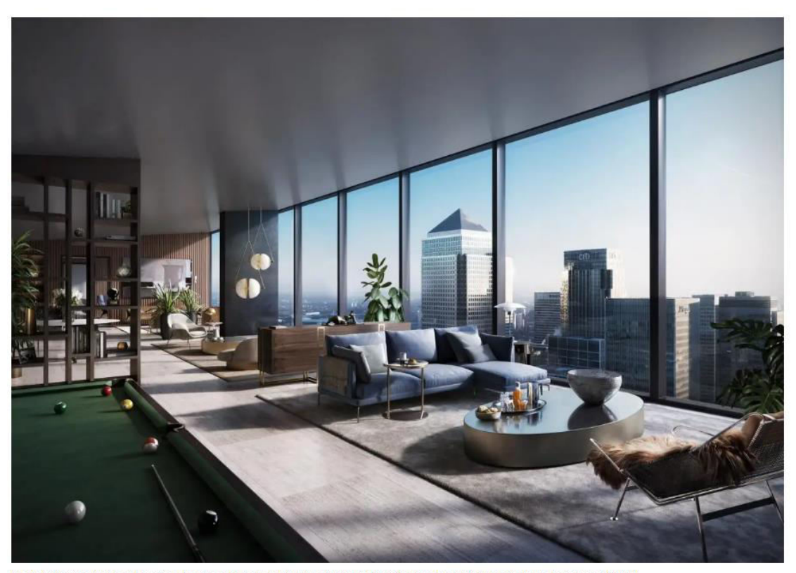
From £542,750: flats at Landmark Pinnacle in Canary Wharf, Europe's tallest residential tower at 75 storeys and 748ft

DAVID SPITTLES | Tuesday 12 March 2019 12:04 GMT | 🗇 0 comments