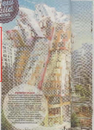
PROSPECT PLACE Battersea Power Station has long been a landmark industrial building. Now, its reinvigoration for housing is in its final development phase. Prospect Place is the first phase of new homes, shops, restaurants and cafes, as well as community events spaces. Prices start at £260,000 for a one-bedroom apartment with two beds from 80sq m. The majority of the winter gardens. A two-bedroom apartment in the newly designed Prospect Place is priced at £133,000. prospectpowerstation.co.uk