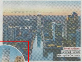
One Park Drive is the tallest residential tower by number of floors and the final addition to the Landmark trilogy, consisting of the 45-floor Landmark East and 35-floor Landmark West.

Further west, White City Living is developer St James' 10-storey, multi-building scheme of 1,477 new