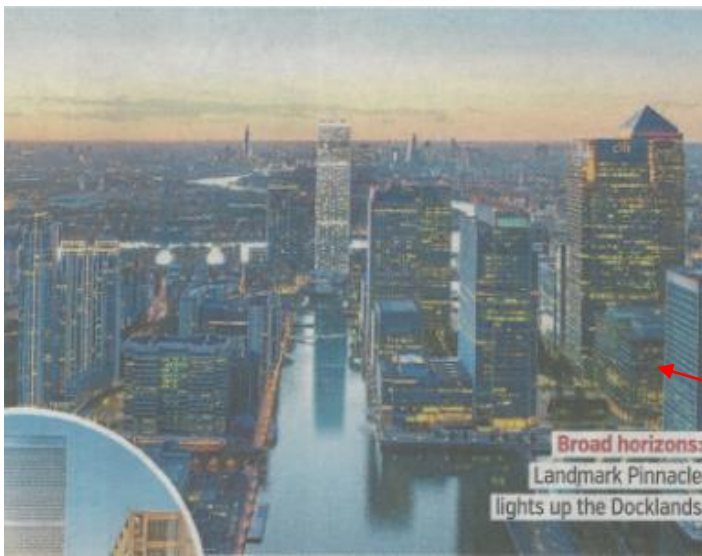
Broad horizons: Landmark Pinnacle lights up the Docklands