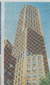
KEYBRIDGE TOWER Standing on the south side of the river, Keybridge is home to Keybridge Tower. Created by award-winning developers Mount Anvil and FABRICA by AJD Architects, the 37-storey Keybridge Tower is a landmark development, as it will be the UK's tallest brick residential edifice when completed.

The 470 new homes consisting of studios, one to three-bedroom flats and penthouses start at £175,000 - with competitors for Keybridge House at the end of this year and Keybridge Lofts in 2018. keybridge.london.com