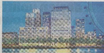
SOUTHBANK PLACE Heading into town, situated between Waterloo and County Hall Behind the London Eye stands the River Thames, Southbank Place is one of central London's best located developments. Consisting of seven buildings of varying heights with three residential blocks and a central square, the riverfront setting and grand scale ensure its status as a future landmark. Now 70 per cent sold, the last few two and three-bedroom apartments for sale are priced from £2.4million. Flats come with Miele appliances and the development also features a health and fitness facility and spa. southbankplace.com