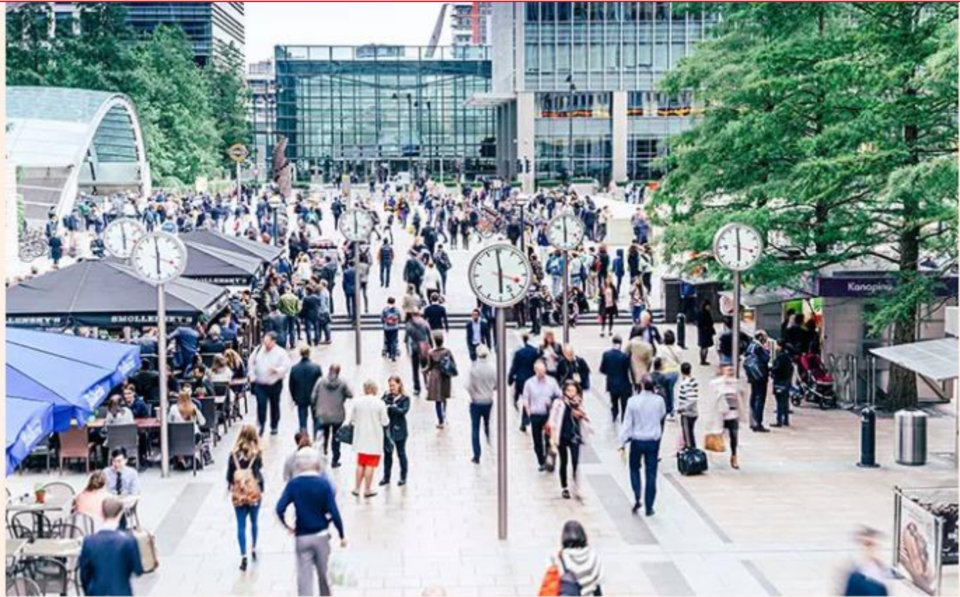
Reuters Plaza in Canary Wharf

The towers are in good company. The 115-unit Dollar Bay building was completed last year; the Wardian, a two-tower 764-unit Ballymore and Eco-World development, will be completed in 2019; the Berkeley Group's 68-storey South Quay Plaza development will be completed in 2020. In the same year, the Landmark Pinnacle will become one of the tallest residential buildings in Europe, just beaten by another Canary Wharf development, the 861-unit Spire London. At the same time, London City Island, a new 12-acre neighbourhood of 1,700 apartments by Ballymore and EcoWorld on the Leamouth Peninsula, is scheduled for completion next year.