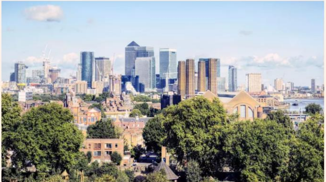
A view of Canary Wharf from Greenwich

The newest towers among skyscrapers in the East London district will contain residential units