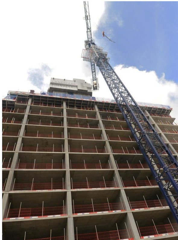
Looking up: The Pinnacle is due for completion in late 2020

Building a tower this tall at a waterside location is not without its challenges.