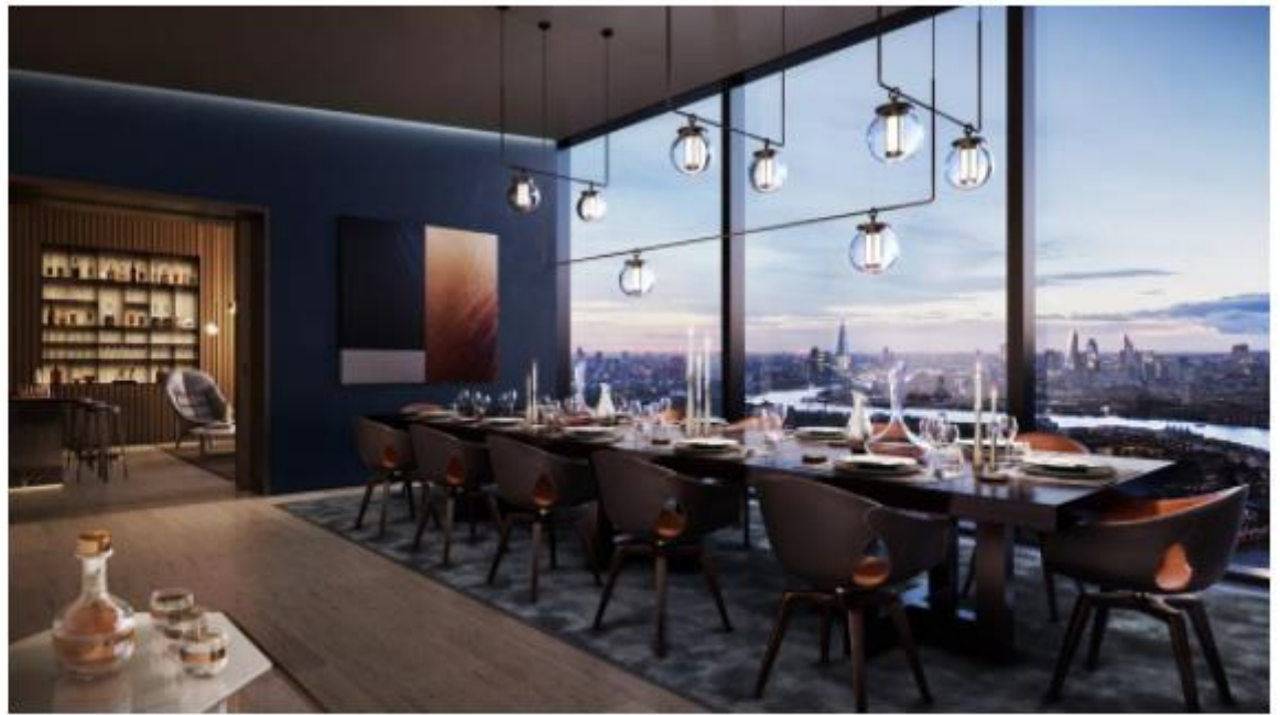
High tea: One of the two private dining areas on level 56

Prices will range from £425,000 to £1.55million, while the service charge will work out at £5.68 per sq ft per year.