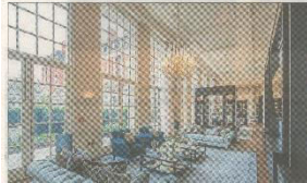
Offers over £2.95 million: the East Wing at The Star and Garter, Richmond Hill

technology controls heating, lighting and audiovisual entertainment. London Square, the developer, is inviting offers over £2.95 million. Other homes for sale at The Star and Garter start at £1.995,000. Apartment residents arrive via a marble hall with grand staircase, while the restored King's Room is a spa and there is an Art Deco-style screening room for residents to enjoy. Call on 0333 666 0922 for more information.