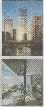
From £542,750: flat at Landmark Aradeo, top, in Canary Wharf. Europe's tallest residential tower at 75 stories and 738ft shows spectacular Docklands views from the Warden London tower