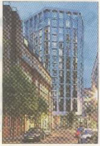
Covent Garden, with its historic buildings, is a prime location for new homes. Parker Tower is a prime example of modern architecture in a historic setting.

The block has a hotel-style reception foyer, basement parking, secure cycle racks plus storage areas and concierge services for residents. Prices start from £250,000 and people living or working in Camden borough have priority for the shared-ownership flats, in which the minimum equity stake is 25 per cent. Call 020 8502 3758.